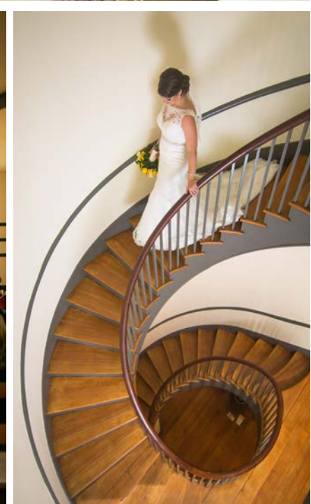
TO VIEW MORE SHAKER VILLAGE WEDDING IMAGES, VISIT OUR PINTEREST PAGE.