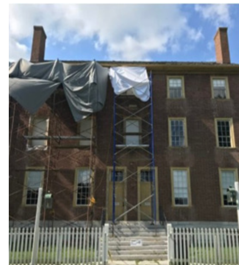
Preservation efforts in progress, July 2019

When SVPH closed in March 2020, the preservation staff was well-into a large project related to the 1817 East Family Dwelling. A private donation from a generous donor enabled SVPH's talented team of craftsmen to continue this work while the Village was closed to the public, focusing on the building's windows and doors and replacing the wood shingle roof.