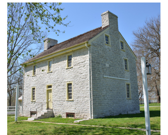
Cleaning and repointing success, 2020

and the 1811 Old Stone Shop. When you visit this spring and summer, you will notice work has begun on the 1835 East Family Wash House.