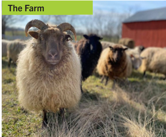
The flock of “lawn mowers” that care for the E.W. Brown Generating Station’s solar panel field.

The Farm at Shaker Village is a year-round operation that requires daily attention to our more than 100 animals. In 2020 our “family” grew to include six lambs, six calves, 18 ducks and 36 new sheep (Shetland and Katahdin). We also expanded the farm footprint to 118 acres by adding a 68-acre tract of native grasses and added blackberries, flowers and green space near The Orchard. One of the biggest challenges we faced at the Farm was food production. When we closed in March, our farmers already had hundreds of plants growing in the greenhouse to support our farm-to-table dining experience. With the dining room closed, and later open at a reduced capacity, we were able to donate more of our produce to food banks and pay-it-forward restaurants. We also began a Community Supported Agriculture (CSA) model in the fall that will continue to expand in 2021.