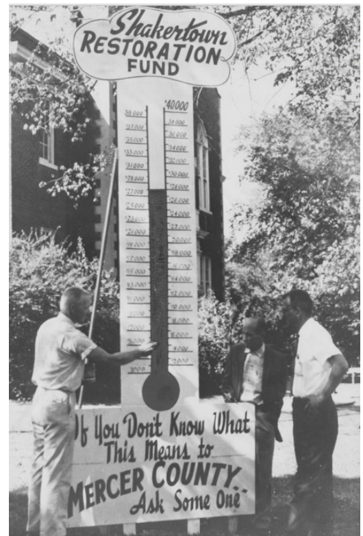
An example of early fundraising efforts led by leaders of Shakertown at Pleasant Hill, Kentucky, Inc.

If we can learn one thing from the community leaders who helped form our nonprofit Shakertown of Pleasant Hill, Kentucky, Inc. in the 1960s, it is that we should remain undaunted by the task of preserving this site for the next 60 years and beyond. To prepare for the future we are continuing our efforts to improve and innovate the guest experience with new permanent exhibits, commitments to the preservation of our 34 historic buildings which are the cornerstone of our history and maintaining the cultural landscape across 3,000 acres.