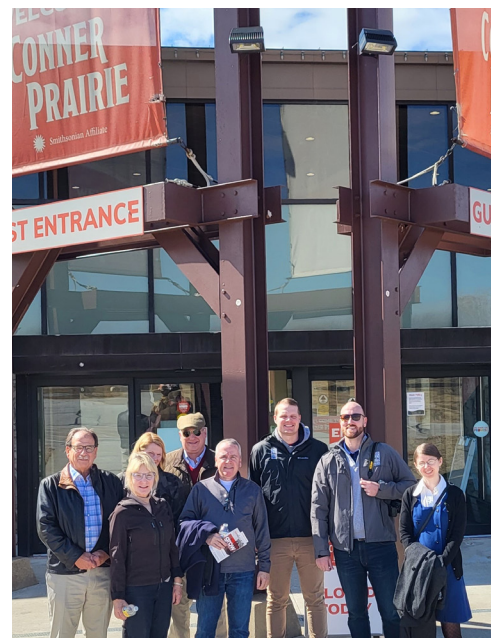
Our team visited sites like Conner Prairie to gather insights and inspiration into what works and what doesn't for Shaker Villages' long-range plan.